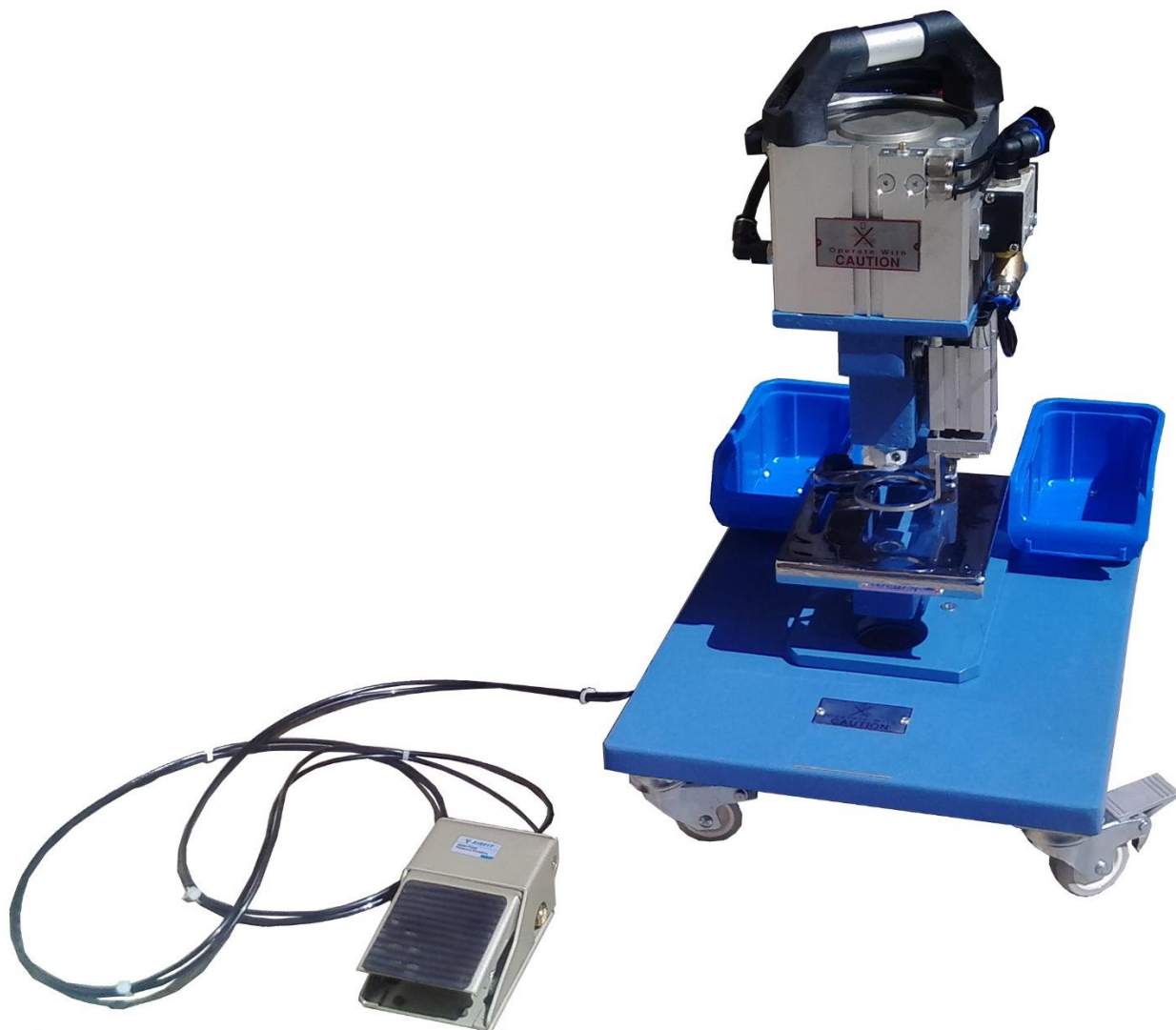
Tent Self Piercing Grommets